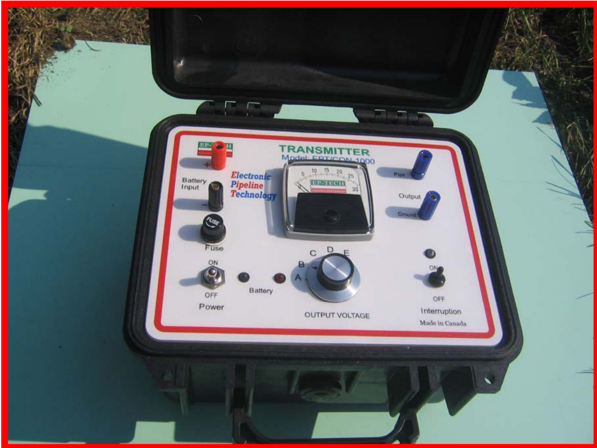
EPT- 1000" Transmitter